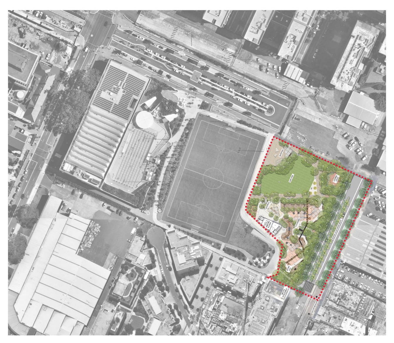
Fig 4. Site Area shown overlaid on the existing aerial image. GPARC Stage 2 design & George Julius Avenue concept design shown within the dashed red extent of works line